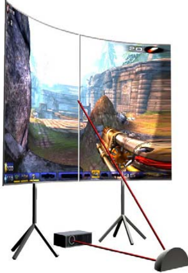
Figure 1: Drawing of our prototype surround display, 110° horizontal FOV

Fully featured virtual reality systems, such as the CAVE [1], provide nearly all of these cues, while others provide only some. For example, in 'Fish Tank VR' a single computer monitor produces a stereographic image while a head-tracking system adjusts the perspective effects based on user motion. Other systems achieve a degree of sensory immersion by simply filling most or all of the user's view with a "window" to the virtual environment. We call these "surround displays," with the new all-digital planetarium displays being the best example.